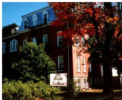
The Maison Sainte-Marie in Vankleek Hill (Ontario).

Since everyone enjoyed our new venue, our 6 th Annual Retreat will be held again this year at the Maison Sainte-Marie of the Sisters of Sainte-Marie, located at 159 Higginson St. in Vankleek Hill, Ontario (about 95 km West of Montréal). The dates are Friday Night May 5 th and Saturday May 6 th , 2006.