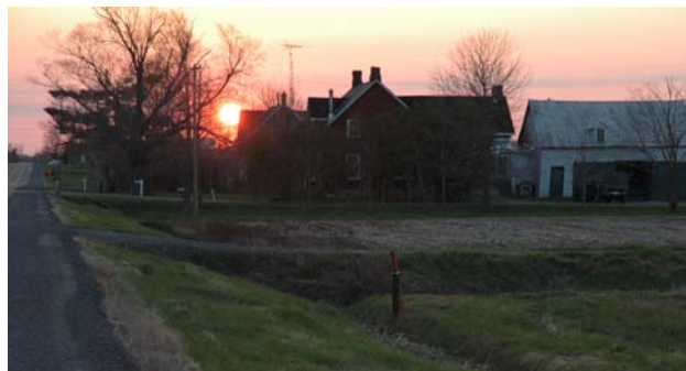
The Maison Sainte-Marie is in the picturesque Ottawa valley.